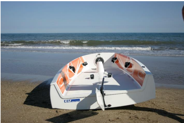
Open transom with mounted Foot straps