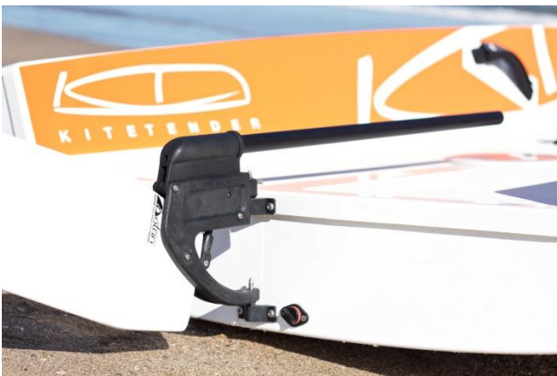
Rudder, pivoting transom fittings, release plug