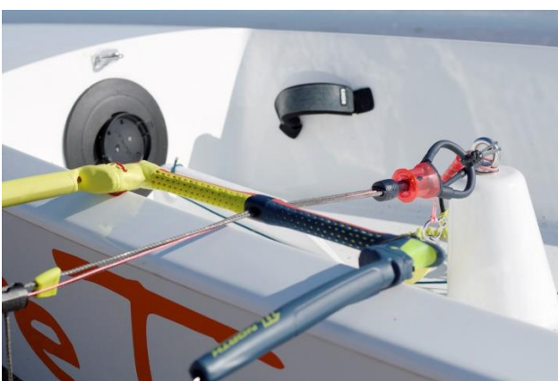
Kite attachment point with Emergency release

More info at www.kitetender.nl or have a look at YouTube kitetender channel https://www.youtube.com/channel/UCCN8NzLqKBCUhLh12Pw4kwa